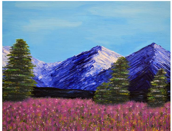
Illustration at right by Annabel Bradley

This service is recommended for use on April 19, 2020, the Sunday immediately before the 50 th Anniversary of Earth Day (April 22, 2020), but can be used anytime. It will also be used for the Service at the annual meeting of the Wisconsin Conference in June 2020.